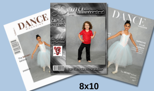
8x10 Magazine cover

Variety of Memory Mate Choices: Option of adding Dancer's Name & Group or Song Title. Online Ordering: Individual Orders, Packages, Group Photos and Individual Digital Orders.